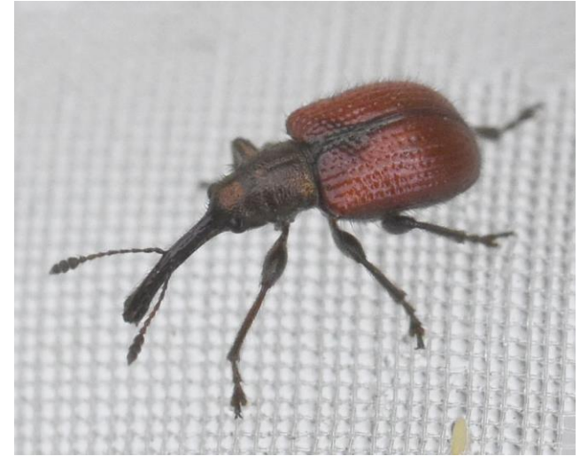
The fascinating world of the mini-beasts! Two tiny weevils. I found these both at Last Wood Meadow, then found the one below in my front garden too, , in a Hawthorn bush.