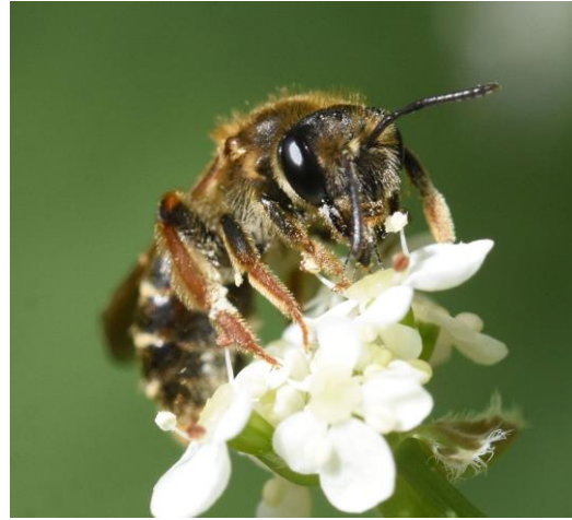
Two Bees found on Blatchington Golf Course. The Hawthorn Mining Bee (above) and the quite scarce Small Flecked Mining Bee