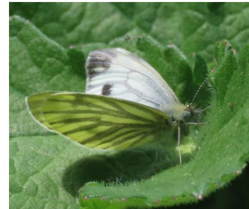
Green Veined White

This early Common Blue was a welcome sight too