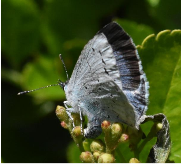
Two more Spring species from my garden. Holly Blue, and the Buffish Mining Bee